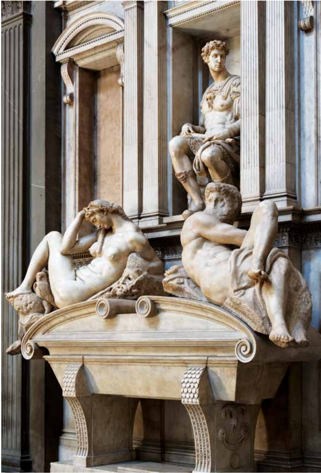
VILLA I TATTI SERIES, 33