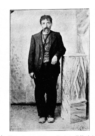
Είκ. 4.— Ο ίδιος Κ. Γ.... γενόμενος άλκοολικός.